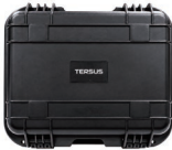
1 x MVP S1 Storage Box 870004