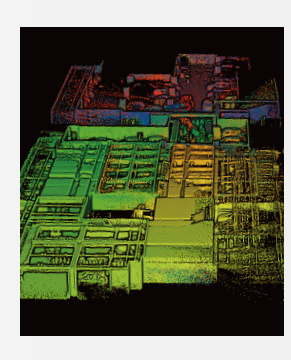
Indoor structures, underground parking area