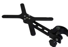
1 x Bracket for TC40 5721010000129