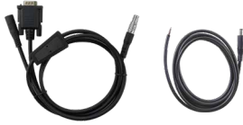
1 x Serial-5pin to DC JACK & DB9 Male Cable 1571010000070 1691020000070