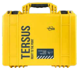
1 x Carrying Case for Oscar Rover 5801010000084