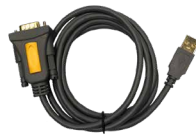
1 x DB9 Female to USB Type A Male Converter Cable 3171010000083