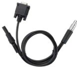
1 x Configuration Cable for External Radio 5251010000070