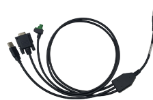
1 x COMM2-7pin to TR600-DC-2pin & DB9 Female & USB Cable