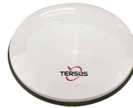
1 x AX3702 GNSS Antenna