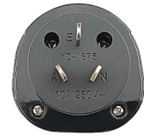
1x Travel Adapter GN901A / GN901E / GN901G / GN901N [2]