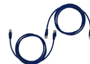
2 x Ethernet Cable 1.5m