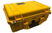
1 x Carrying Case