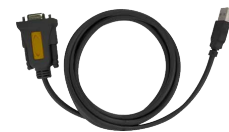
1 x DB9 Female to USB Type A Male Converter Cable