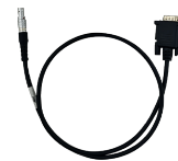
1 x COMM1-7pin to DB9 Male Cable