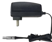
1 x DC-2pin AC Power Adapter with 1.2m Cable