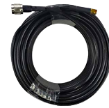
1 x TNC-J to SMA Cable [1]