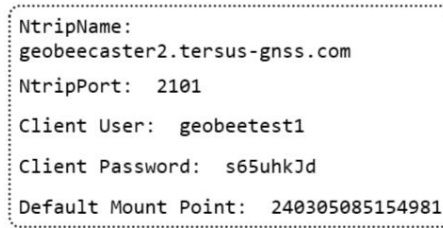
Figure 2: Label on Ntrip Modem TR600

In the login window, type the (Ntrip) Client User and (Ntrip) Client Password which are shown on the label of the Ntrip Modem TR600.