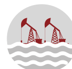
Mining, oil and gas and more