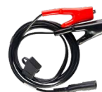
1 x Bullet-DC to Alligator Clips 1191010000070