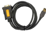
1 x DB9 Female to USB Type A Male Converter Cable 3171010000083