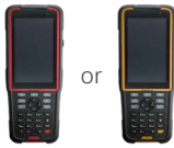
1 x TC20 Controller 521 (Red) 522 (Yellow)