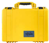
1 x Carrying Case for Oscar Rover+Base 5471010000081