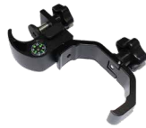
1 x Bracket for TC20 5111010000114