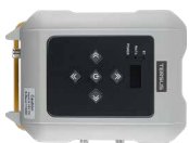
1 x External Radio RS400H3 5331010000005