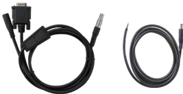
1 x Serial-5pin to DC JACK & DB9 Male Cable 1571010000070 1691020000070