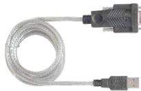
1 x DB9 Female to USB Type-A Male Converter Cable ACC1010000015

[1] The model of the cable will be delivered according to customer requirements.