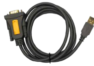
1 x DB9 Female to USB Type A Male Converter Cable 3171010000083