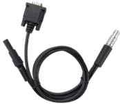
1 x Configuration Cable for External Radio 5251010000070