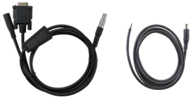
1 x Serial-5pin to DC JACK & DB9 Male Cable 1571010000070 1691020000070