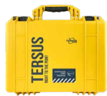
1 x Carrying Case for Oscar Rover 5641010000081