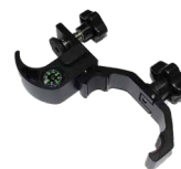
1 x Bracket for TC50 5631010000073