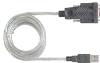
1 x DB9 Female to USB Type-A Male Converter Cable ACC1010000015

[1] The model of the cable will be delivered according to customer requirements.