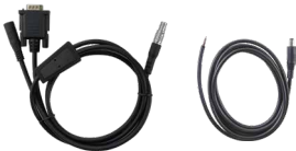
1 x Serial-5pin to DC JACK & DB9 Male Cable 1571010000070 1691020000070