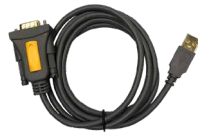
1 x DB9 Female to USB Type A Male Converter Cable 3171010000083