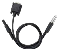
1 x Configuration Cable for External Radio 5251010000070