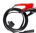
1 x Bullet-DC to Alligator Clips 1191010000070