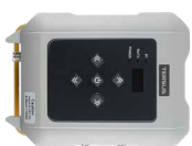
1 x External Radio RS400H3 5331010000005