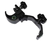
1 x Bracket for TC50 5631010000073