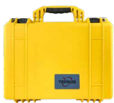
1 x Carrying Case for Oscar Rover+Base 5471010000081